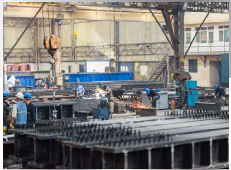
Vertical Showcase - Manufacturing & Logistics, Pg. 14-15