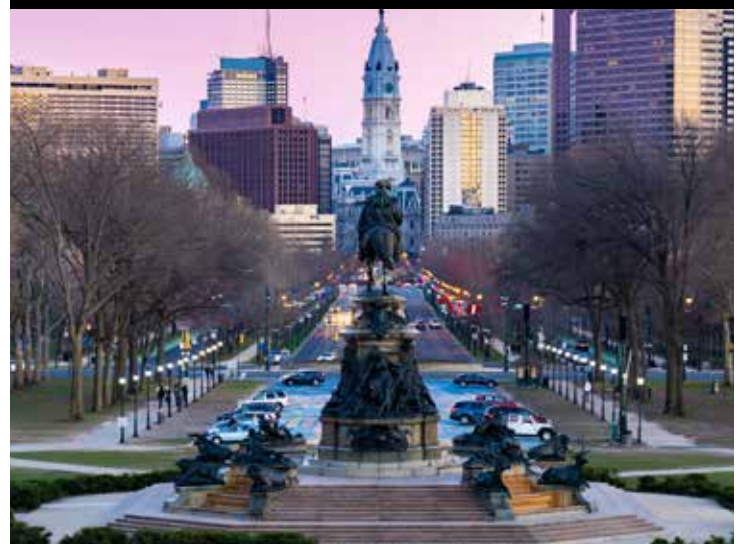
Marksman on the Move, Pg. 19