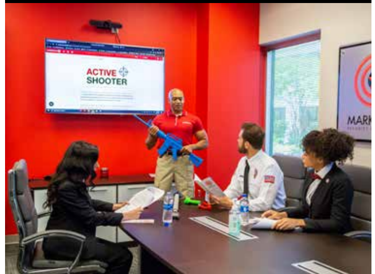
Quarterly Safety Feature, Pg. 18