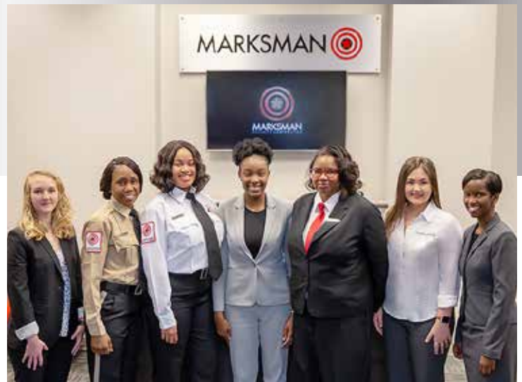
Women in Security, Pg. 4-5