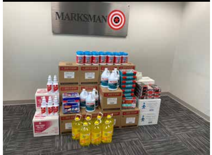
Safety Feature, Pg. 9