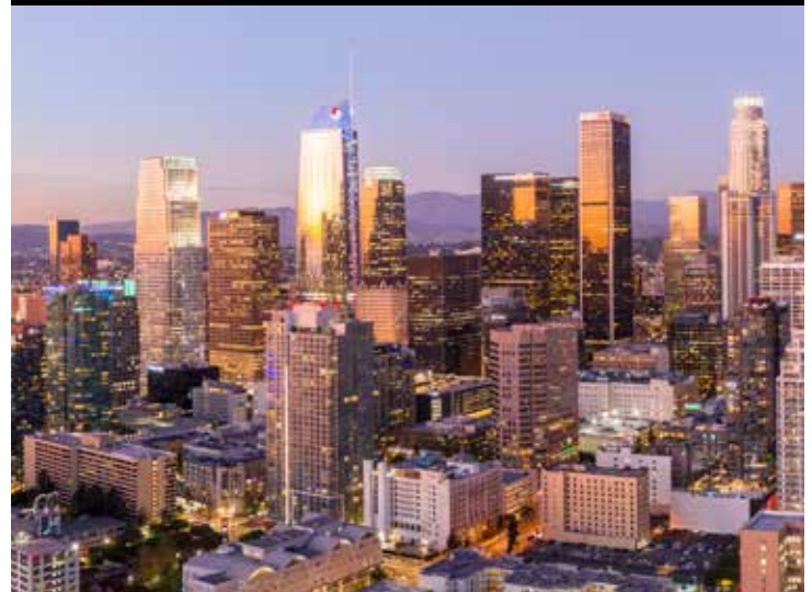
Marksman on the Move, Pg. 19